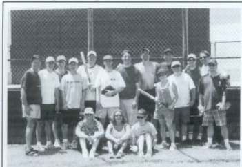
The Third Annual Sons & Maids Reunion Softball Day was held on June 16th in San Marino, CA.

Do you have a golf tournament coming up? Send us a flyer and we will put it online. Is your chapter having a fundraiser or special function? Let us know, and we will post it for you. This online information shar-