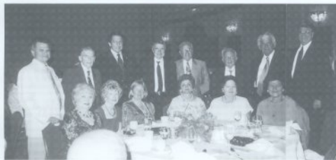
The District 20 AHEPA Family was well-represented at the 2001 Supreme Convention.