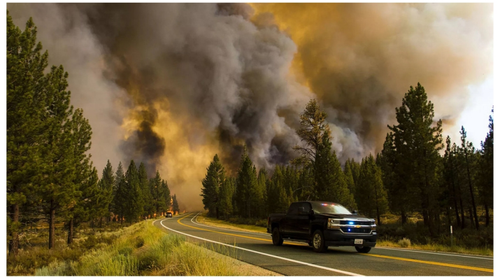
21-07-18 - NY Times - California Wildfires

In January 2021 alone, 297 fires burned 1,171 acres, which is almost triple the number of fires and more than 20 times the acreage of the five-year average for January. In July, more than three times as many acres had burned compared to the previous year through that date. On August 18, 2021, the state of California was facing "unprecedented fire conditions" as multiple fires raged on.