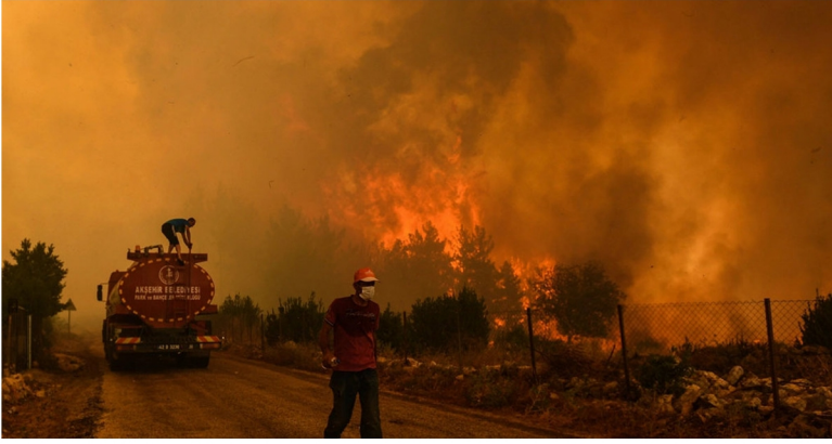
21-08-07 09 - - Wildfires devastate Greece & Turkey